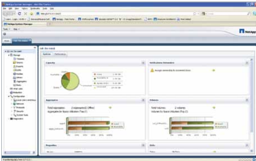
Figure 1) You don't need to be an expert to configure your storage with the simple, easy-to-use NetApp System Manager Console.